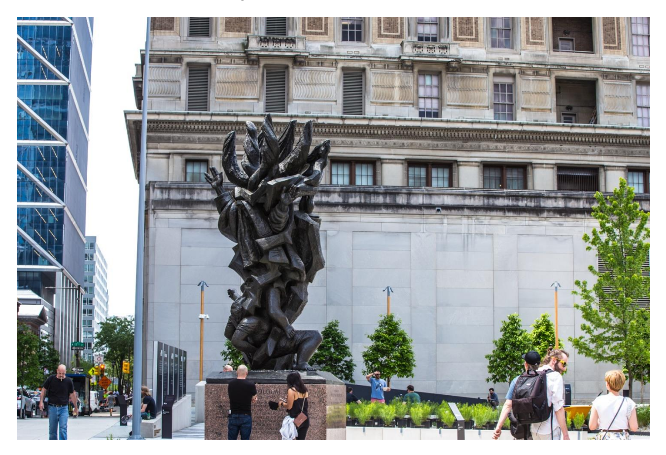
(Description) A photo of the Philadelphia Holocaust Memorial Plaza which now benefits from the Hanwha Techwin's video surveillance cameras

Global security company Hanwha Techwin has successfully installed its Wisenet video surveillance cameras in the Horwitz-Wasserman Holocaust Memorial Plaza, Philadelphia, preventing and responding to all kinds of security events with its crystal-clear images and analytics features.