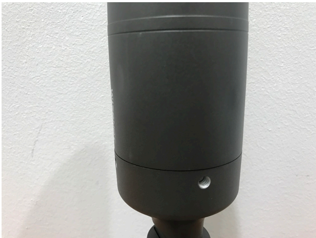
[Test result confirmation_Enclosure 01]