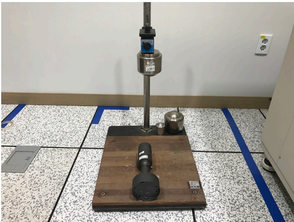
[During the test_Enclosure]