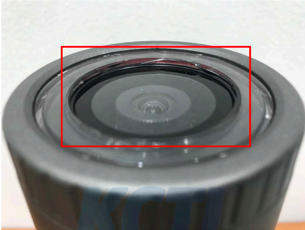
[Test result confirmation_Window]