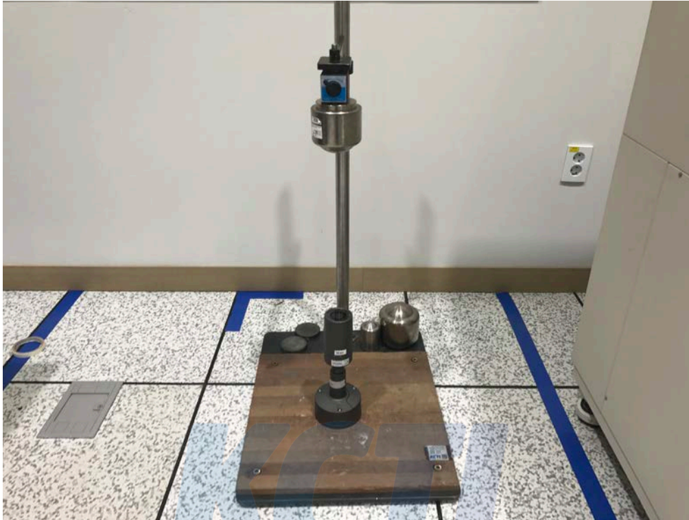
[During the test_Window]