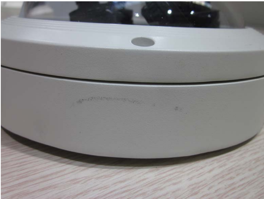
[Test result confirme_ Enclosure 03]