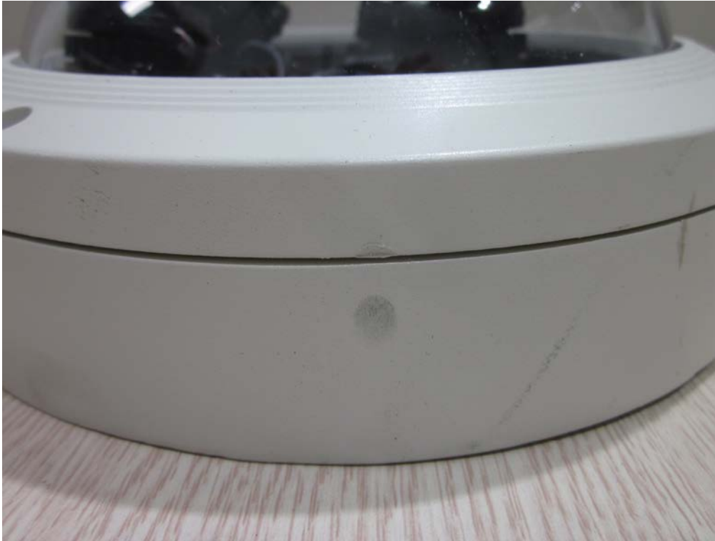
[Test result confirme_ Enclosure 02]