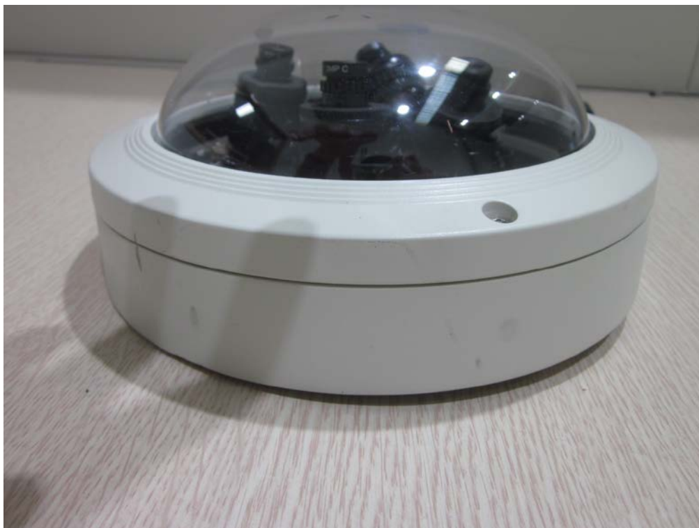
[Test result confirme_Enclosure 01]