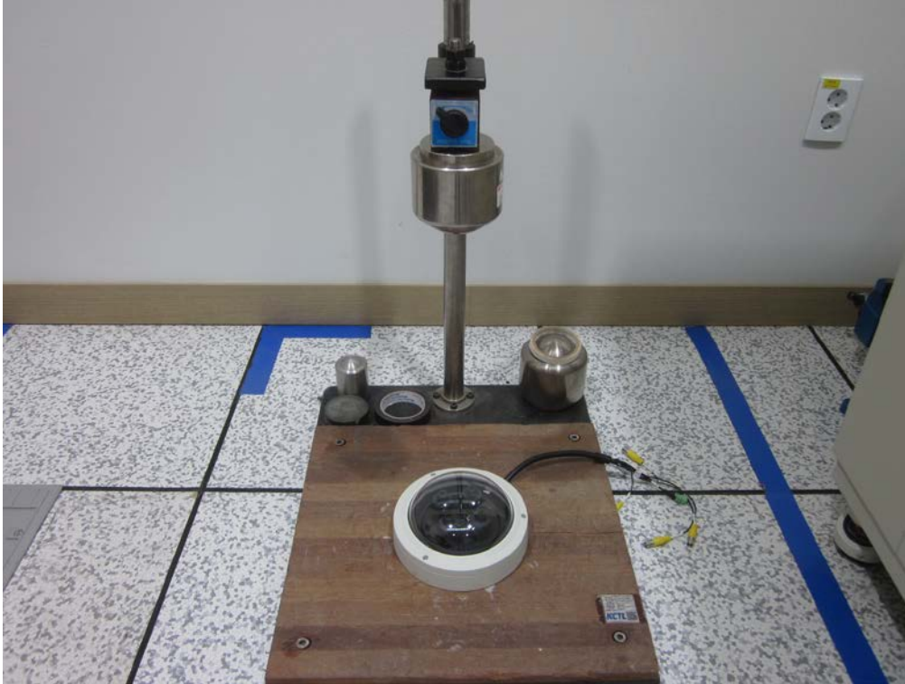
[During the test_Window]