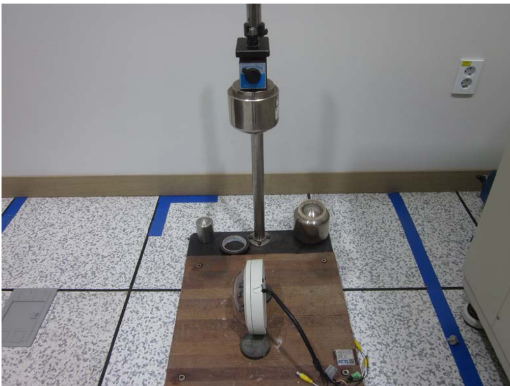
[During the test_Enclosure]