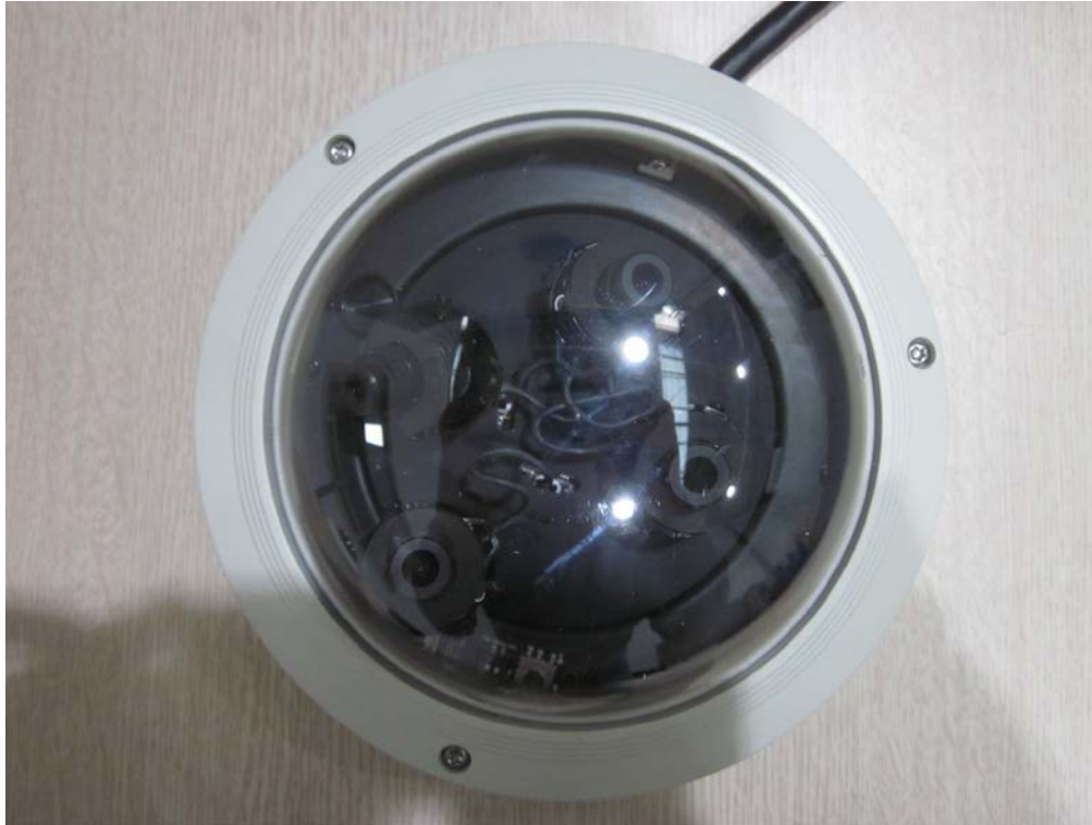
[Test result confirme_Window]