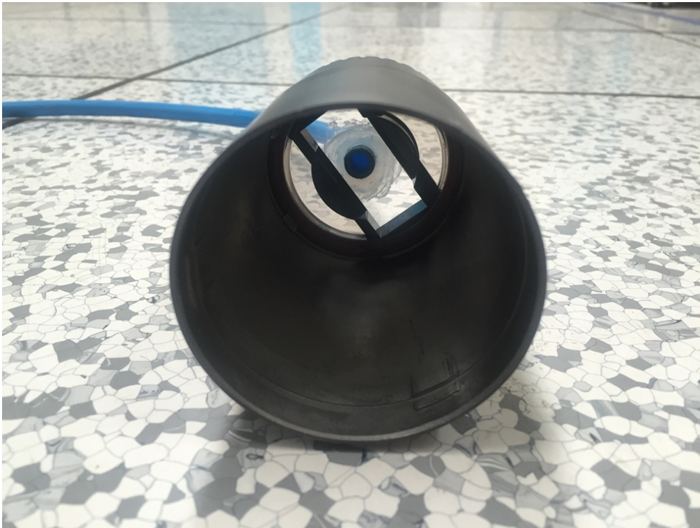
[Test result confirmation 02]