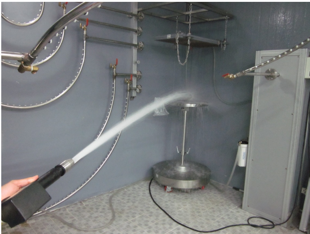
[During the test]