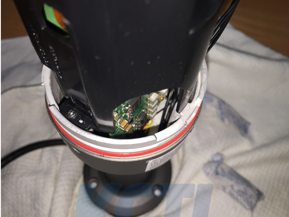
[Test result confirmation 01]