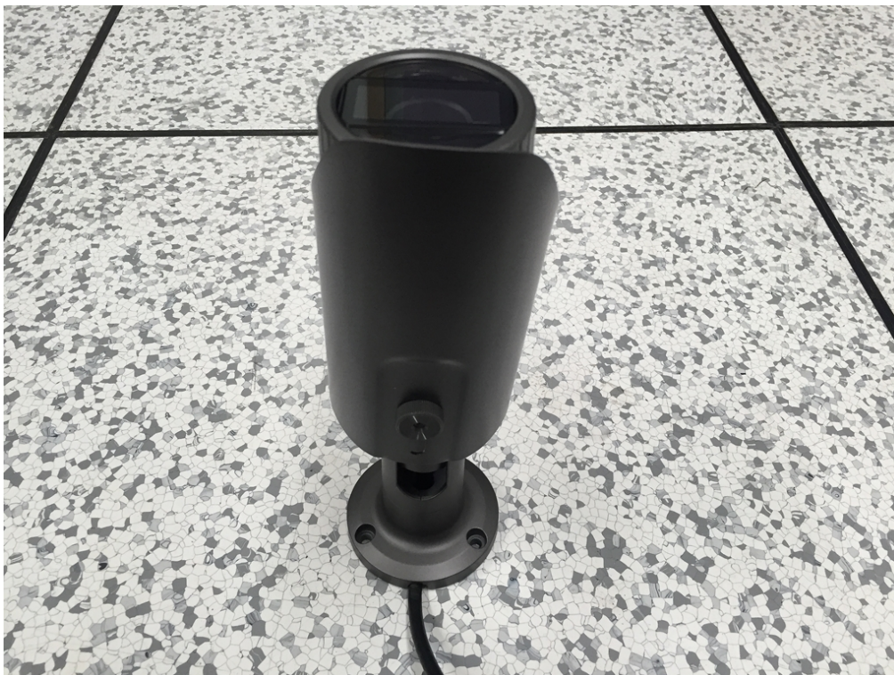
[Product Photograph 02]