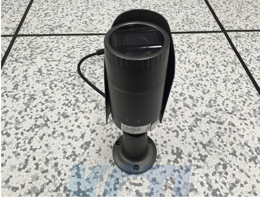
[Product Photograph 01]