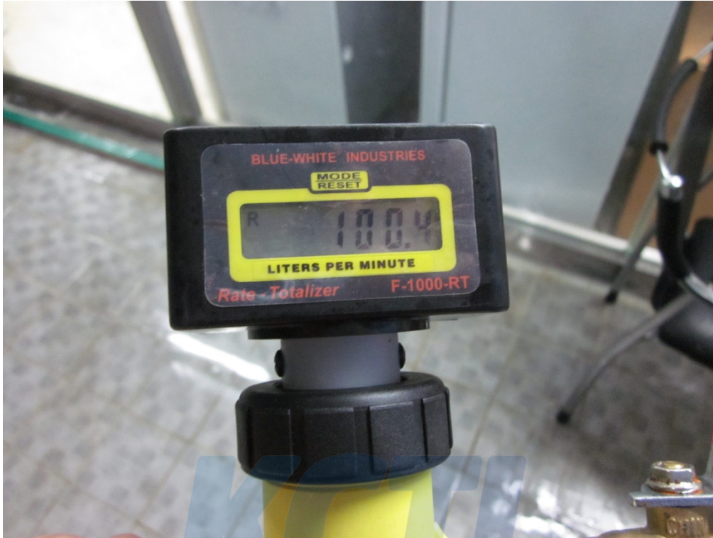
[During the test_Water flow rate]