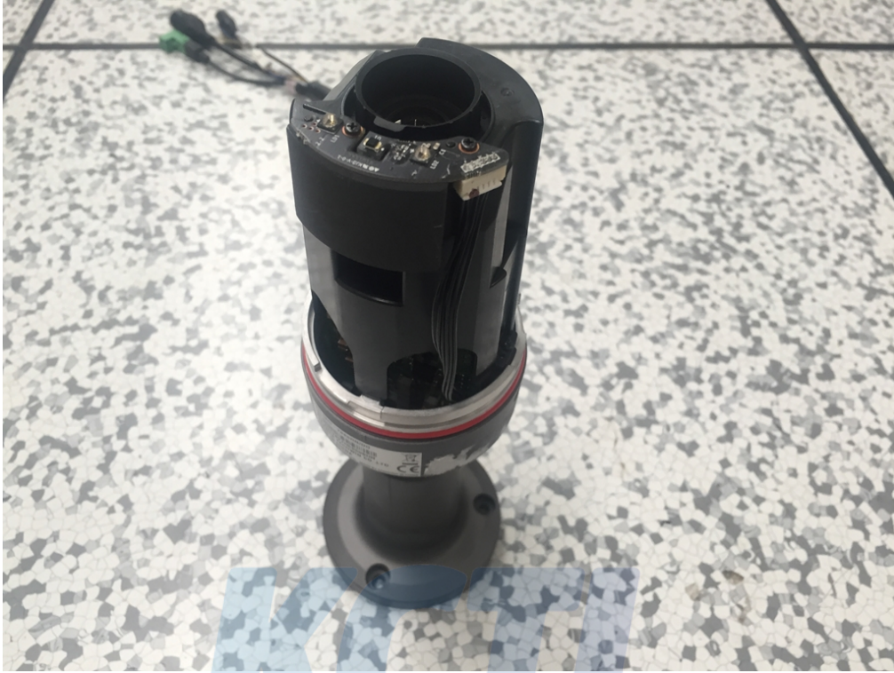
[Test result confirmation 01]