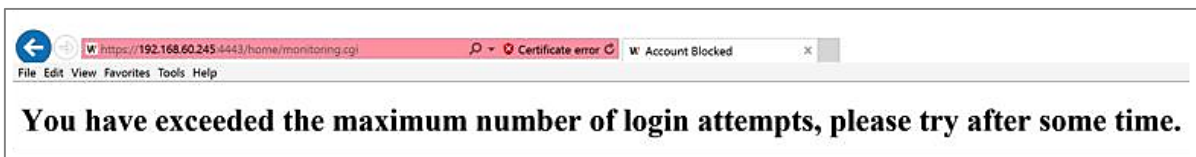
Image 6. Password Input Block

Hackers systematically check all possible passwords and passphrases until the correct one is found. If this attack is allowed, the password will out some time. Hanwha Techwin devices block brute-force attack by not allowing 5 times or more login attempt within 30 seconds to improve its security. Also, existing connection of authorized user's is maintained to prevent denial-of-service while password input is blocked.