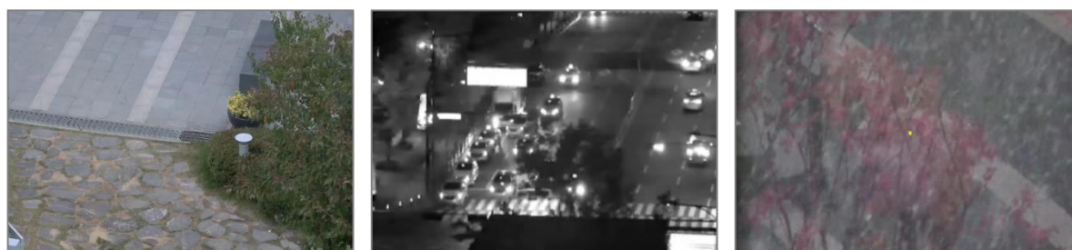
Figure 4. Malfunction Sample

In case of the above, the system detects frequent movement not including the desired tracking subject. When setting presets, setting [Tracking] and [Tracking Period] at [Operation Mode] will automatically return the camera to the set position after the [Tracking Period] expires even due to malfunctioning during auto tracking.